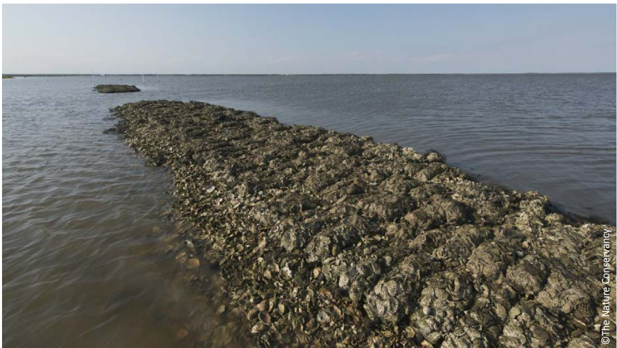
FIGURE A3.12 Nature based solution of artificial oyster reef

Nature Based Solution of artificial oyster reef in preventing USD 50 billion in coastal flooding while creating food source.