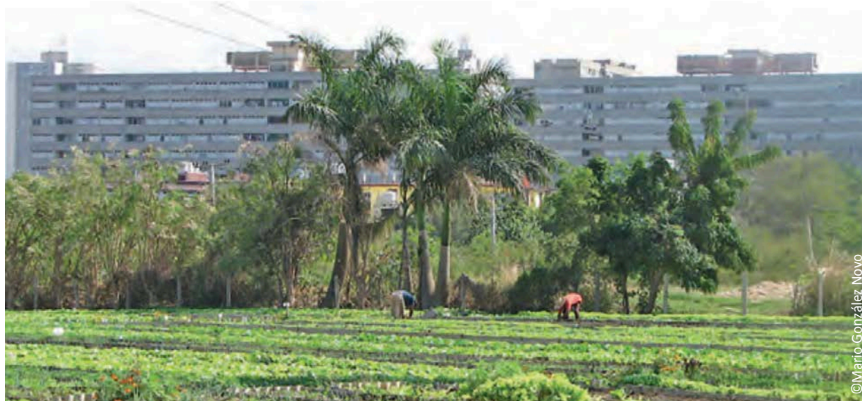
FIGURE A3.2 An organoponic garden near Havana (Cuba)

Cuba's, most famous landmark, Plaza de la Revolución, produces lettuce, chard, radish, beets, beans, cucumber, tomatoes, spinach and peppers