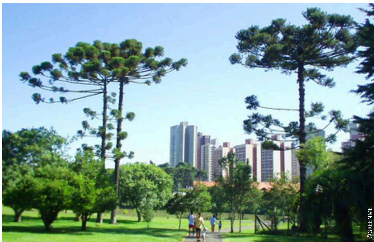
FIGURE A3.3 Curitiba (southern Brazil)

Curitiba, in Southern Brazil, is considered a smart city because of its close relationship with nature. In this image, an example of an urban park preserving the endangered natural tree of this region, the Araucaria angustifolia