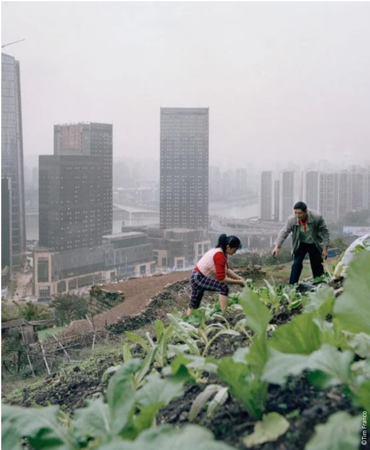
FIGURE A3.7 Chongqing (China): urban agriculture for supporting the food security

Chinese farmers are farming, tilling tiny jewel like plots in Chongqing city.