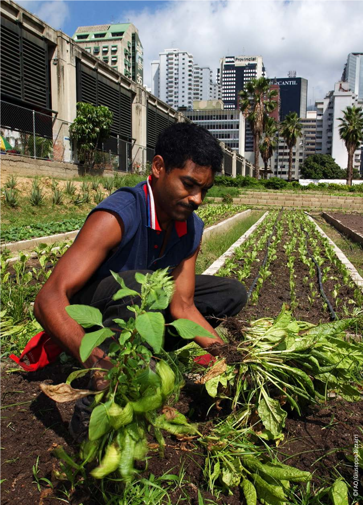
Urban and peri urban agriculture to improve nutrition and livelihoods of poor families.