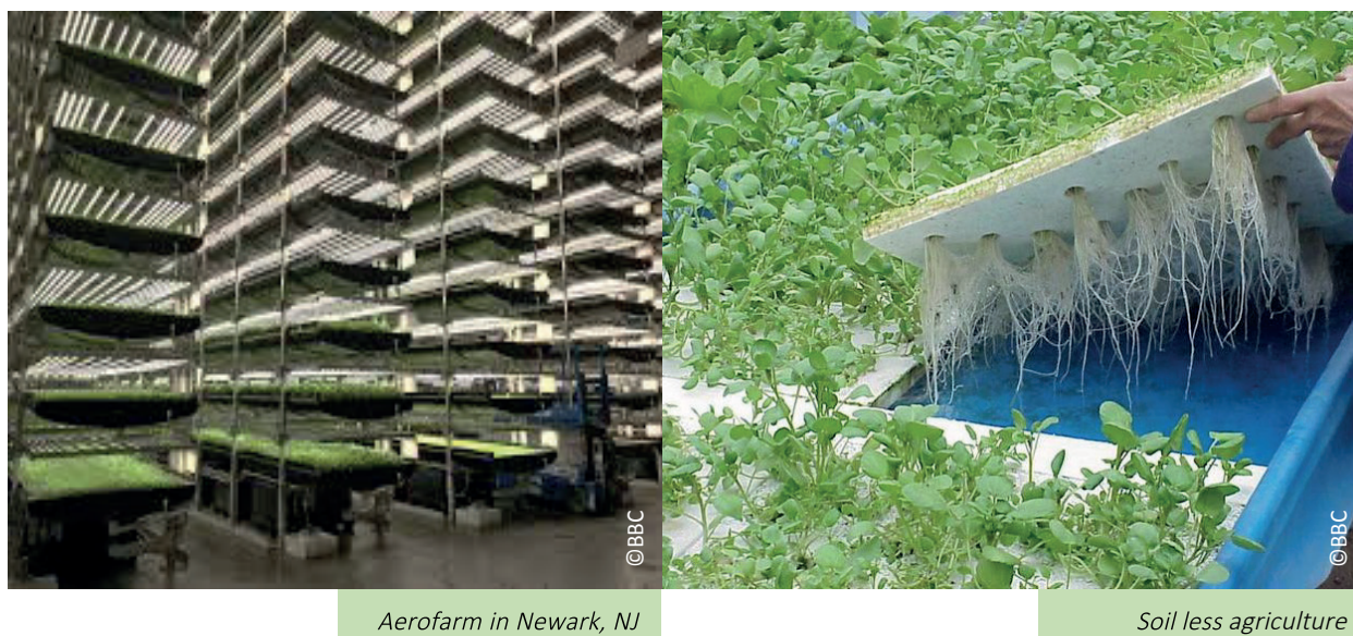
FIGURE A3.1 Closing the loop in vertical farming – Solutions in future urban farming