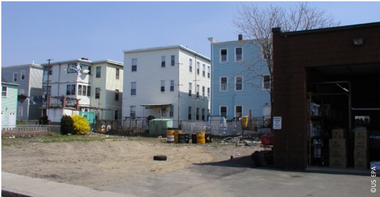
FIGURE A3.13 and A3.14 Examples of urban renewal policies