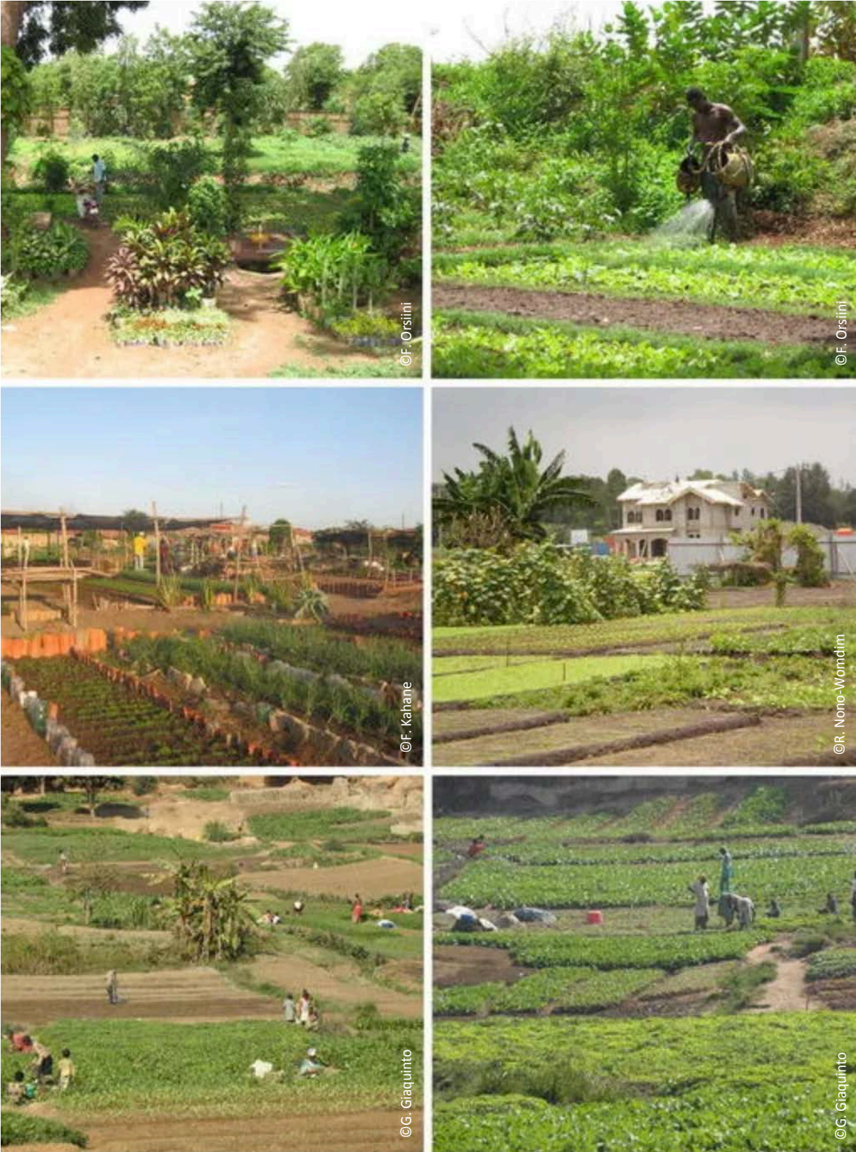
Urban gardens in Ouagadougou, Burkina faso (top), Teresina, Brazil (center left), Abidjan, Ivory Coast (center right), and Lubumbashi (bottom)