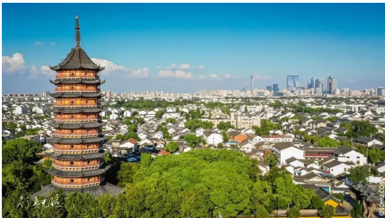
FIGURE A3.4 Suzhou (China): a national ecological garden city

Suzhou has over 2 500 years of history. A good example of the harmony relationship between human and nature of thousand years.