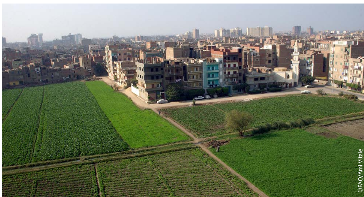
FIGURE A3.5 Crops growing on the outskirts of Fayoume (Egypt)

FAO Project: TFD 03/EGY/002. Rooftop Garden Vegetables Free of Pesticides. To help decrease unemployment rates in the two Governorates involved in the project and income generation for families; to increase the production of free of pesticides vegetable crops; access to fresh and safe vegetables with reasonable prices; and houses with productive, healthy, green, and clean roof tops.